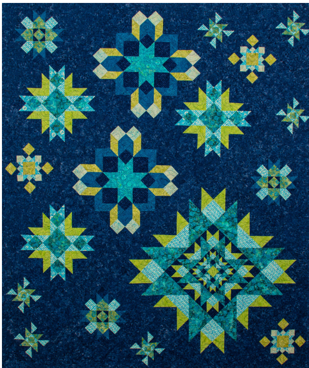
Dusk version of the quilt shown in Just My Type fabric line by Tammy Silvers for Island Batik